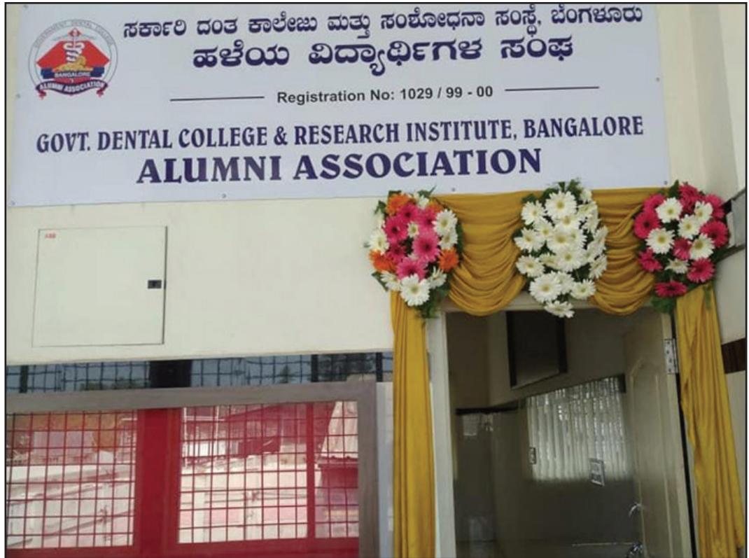
GDCRI Bangalore Alumni Association