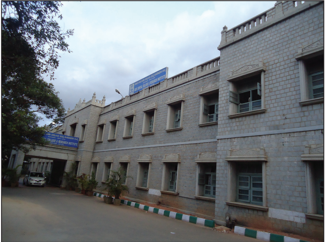
Government Dental College and Research Institute Bangalore